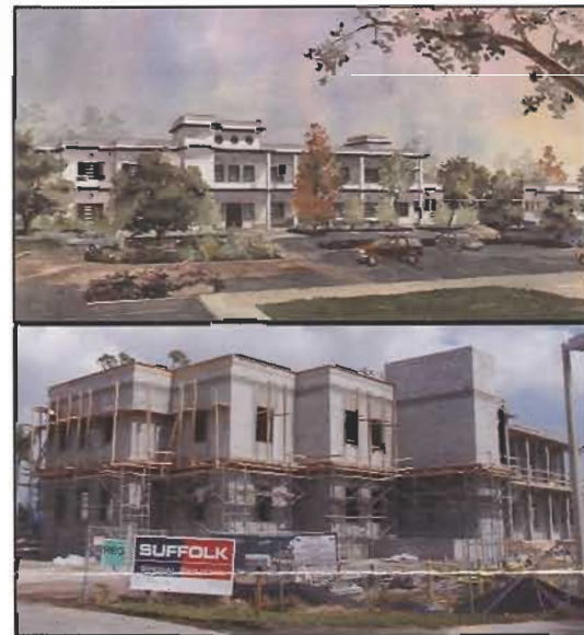
Under construction: Northern's new Administration Building and Emergency Operations Center is scheduled to be completed in September 2006.

There are requirements to qualify for each Seat. Candidates for Seat No. 2 must qualify with the Supervisor of Elections and reside south of PGA Boulevard within Northern's boundaries. If you intend to run, you must register your intent with the Palm Beach County Supervisor of Elections Office during the open candidacy filing period which begins at noon on July 17, 2006 and runs through noon on July 21, 2006. The Elections Office can provide you with the specific requirements pertaining to financial disclosures, filing deadlines, and other election laws. You may contact them by telephone at (561) 656-6200, on their website, www.pbcelections.org ; or click on the "elections" link from Northern's homepage, www.npbcid.org .